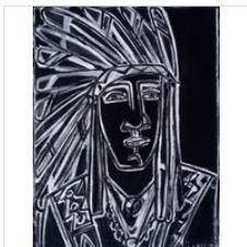
AMERICA MARTIN Raven Headdress, Oil and Acrylic on Archival Paper (unframed)