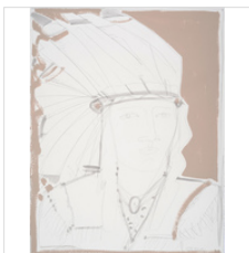
AMERICA MARTIN White Headdress, Oil, Acrylic and Pencil on Archival Paper (unframed)