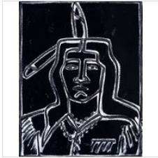
AMERICA MARTIN Two Feathers, Acrylic on Archival Paper (unframed)