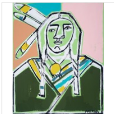
AMERICA MARTIN Three Feathers, Oil and Acrylic on Archival Paper (unframed)