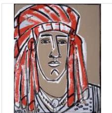
AMERICA MARTIN Red Headdress, Oil and Acrylic on Archival Paper (unframed)