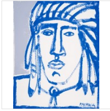
AMERICA MARTIN Blue Brave, Acrylic on Archival Paper (unframed)